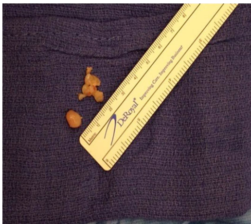
Figure 4: Tumor excised from scaphoid.

Pathology revealed glandular tissue consistent with metastatic adenocarcinoma of the colon. Cultures were negative.