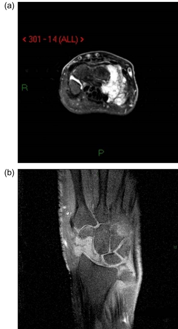
Figure 2: (a) Axillary MRI of the wrist. (b) Coronal MRI of the wrist.

Physical exam revealed no palpable masses and no erythema or swelling. There was tenderness to palpation in the