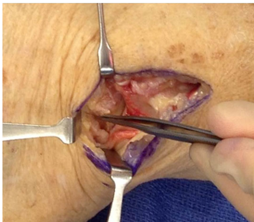
Figure 3: Gelatinous lesion emanating from the scaphoid and cavernous defect in the scaphoid.